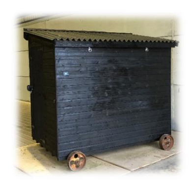
With apologies for the poor Photography!

During the Winter and Spring we have been making preparations for the season. The yellow race buoys have had the barnacles scratched off, the ground tackle of the buoys at the western end have been checked (others in hand) and Lapwing has had some tlc before she is taken out to her mooring at the end of March. Finally, the wooden race hut has had a much needed facelift.